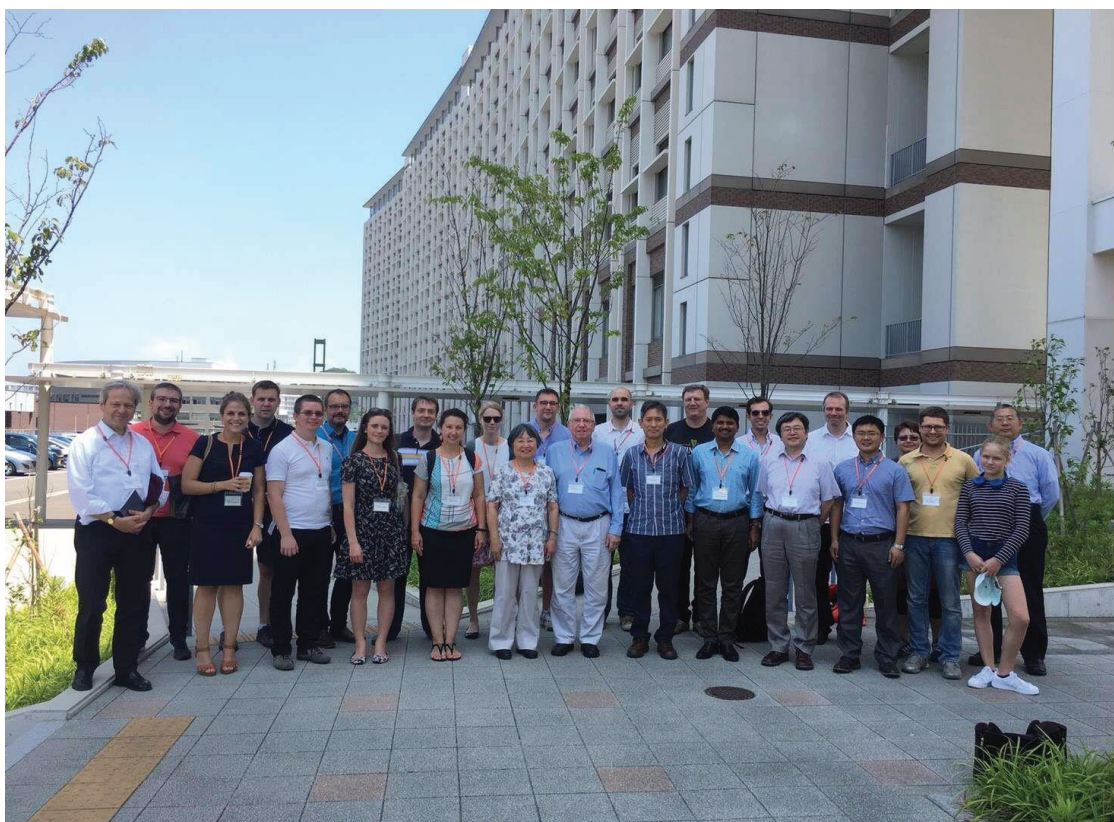
At Post-ICCC, Kyushu University, Fukuoka, Japan