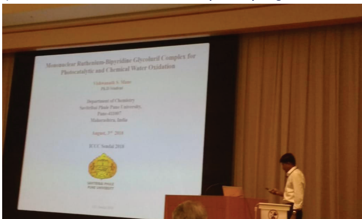
Oral presentation at ICCS Sendai, Japan