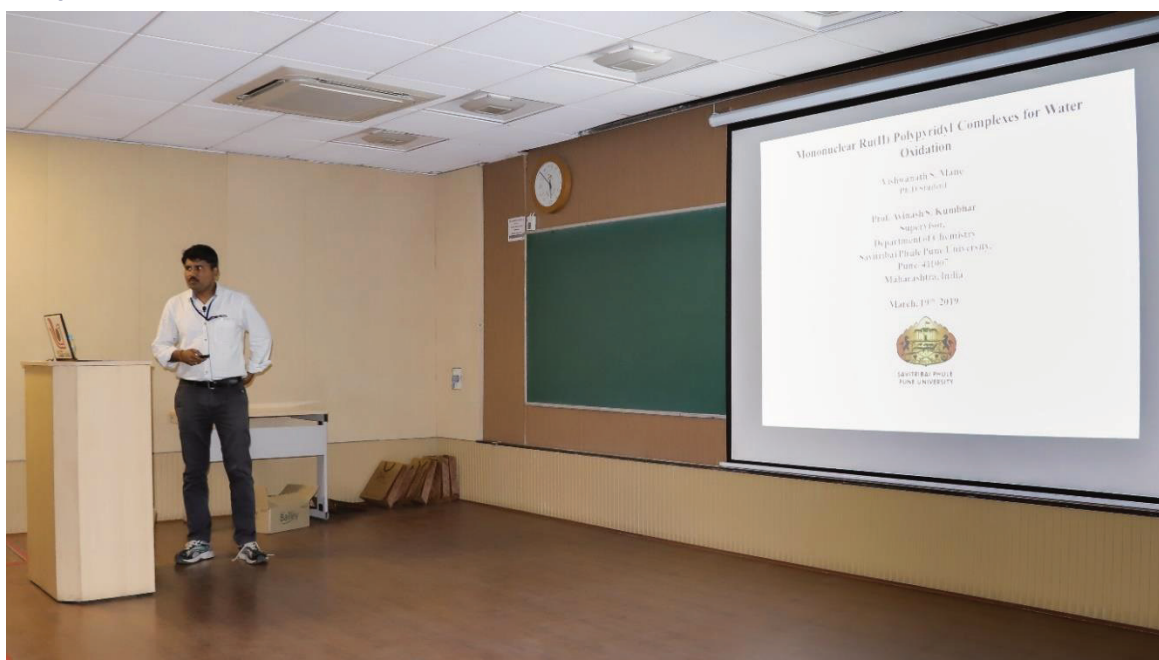
Oral talk at IISER Pune