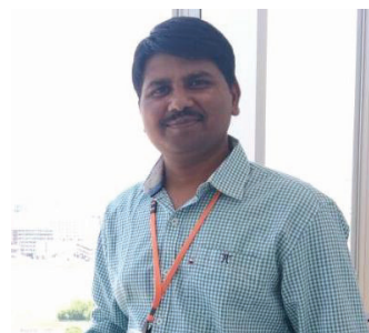
Ph. D Scholar