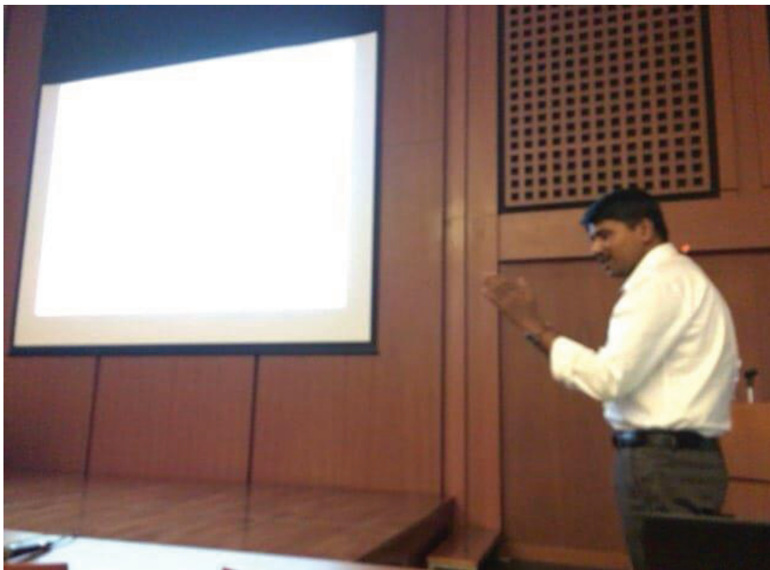
Oral talk at Kyushu University, Fukuoka, Japan on 05/08/2018